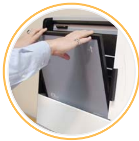
True Flat Scan Path

The iCRVet Dual's small footprint and the optional wall-mount makes it a perfect fit for small spaces or installation inside the X-Ray room for maximum productivity.