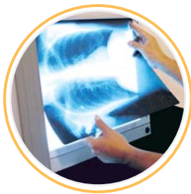
Integrated Film Scanner