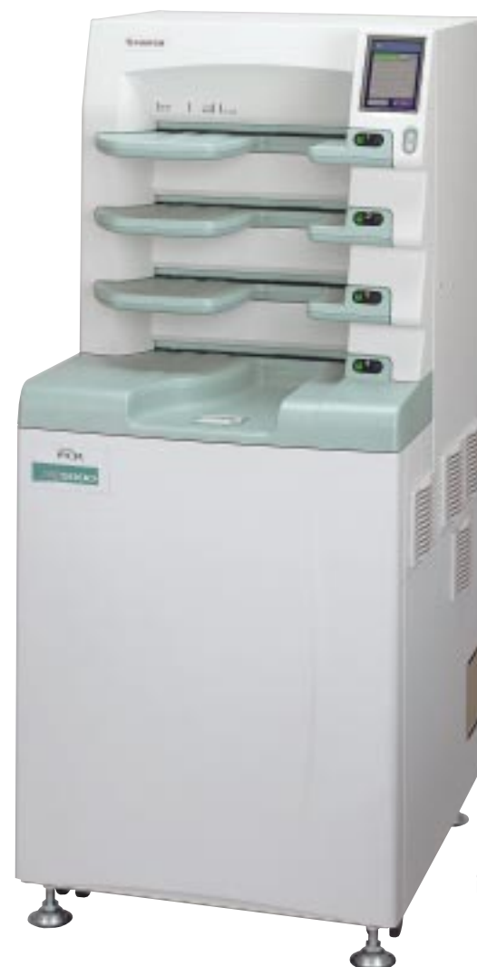
110-volt power requirements for easy room placement

A CR system's ease of use is critical to optimizing efficiency. The Flash IIP console workstation is the user interface to the XG5000 and it is the key to enhancing technologist workflow. Designed for patient identification, image review and image optimization, the Flash IIP integrates these multiple functions into one compact workstation. The simplified user interface automates