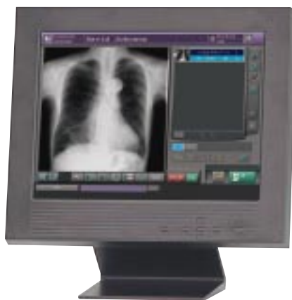
Touch-screen interface and network connection for flexible placement and redundancy

Investments in technology and clinical feedback are essential to product improvements and an optimal user experience. The XG5000 reader was designed to exceed expectations even for the highest volume environments and provide surplus capacity during peak periods. With a throughput of up to 165 Imaging Plates (IPs)/hour, the XG5000 is the fastest system available. The XG5000 four-cassette stacker and product design allow IPs to be read and erased simultaneously for image preview in as little as 15 seconds and cycle time as short as 30 seconds. And the XG5000 is not just fast, it produces consistently high quality images without manipulation to optimize your clinical workflow. Fujifilm recognizes that these features are basic requirements for efficient radiological environments.